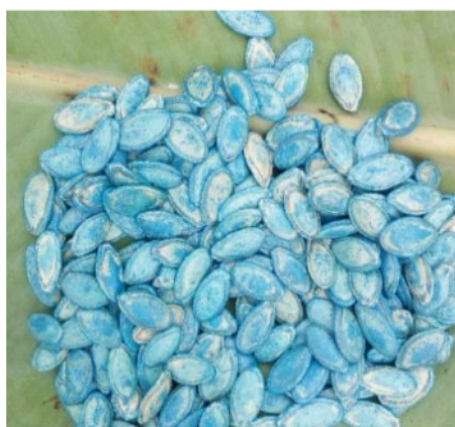
Fig. 1. Zucchini seeds

days). Composting was carried out under a 3 m 85 long, 3 m 20 wide and 2 m 25 high shade structure. Under the shade, the ground was covered with a black tarpaulin film measuring 3 m long by 2 m wide, to isolate the composts from the soil. Next, 50 kg of fresh Panicum sp leaves and 100 kg of broiler droppings and pig manure, depending on the type of compost, were placed on the tarpaulin. When assembling the inputs, the layers were arranged as follows: a 50 kg layer of base input, followed by a 50 kg layer of fresh Panicum sp leaves, then another 50 kg layer of base input. After this operation, the piles were moistened with water until they were saturated.